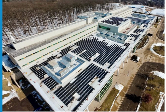
Image: Skyline High School solar expansion

Welcome to the AAPS Capital Program quarterly update! These updates will share highlights of recent activities; however more information is available on the website a2schoolsbond.org .